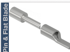
Pin & Flat Blade